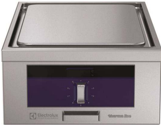
588005 (MALBACEOAO) Electric Solid Top, 2 zones, ecoTop coating, two-side operated